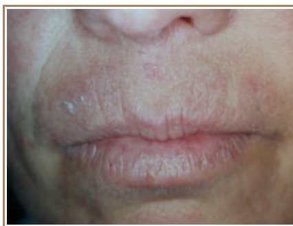
Dermatitis around lips due to contact with p-phenylenediamine